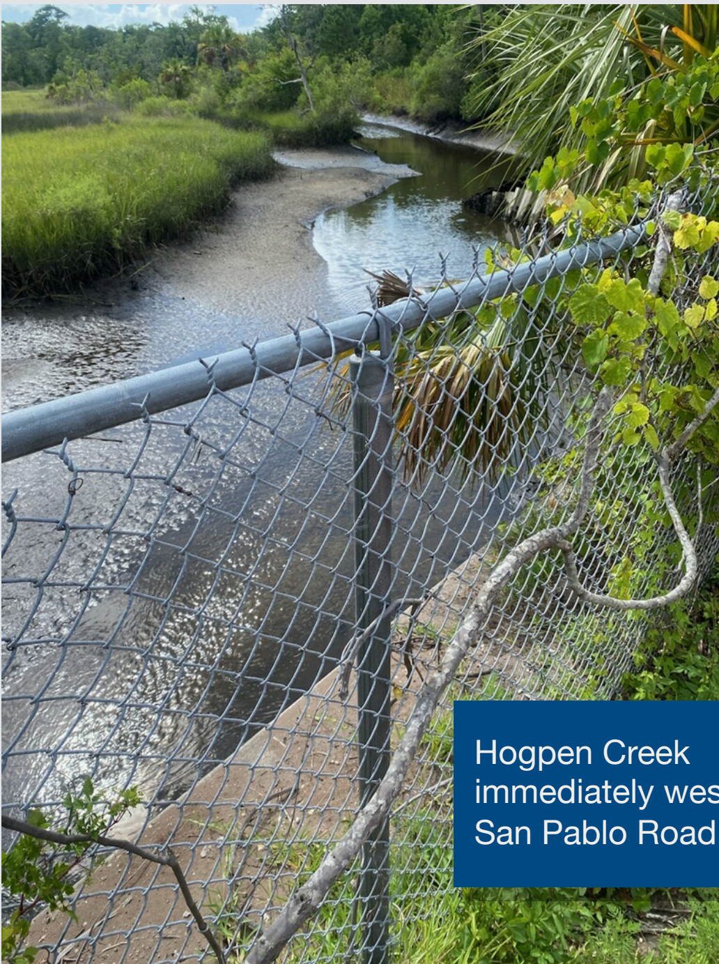
Hogpen Creek immediately west of San Pablo Road.